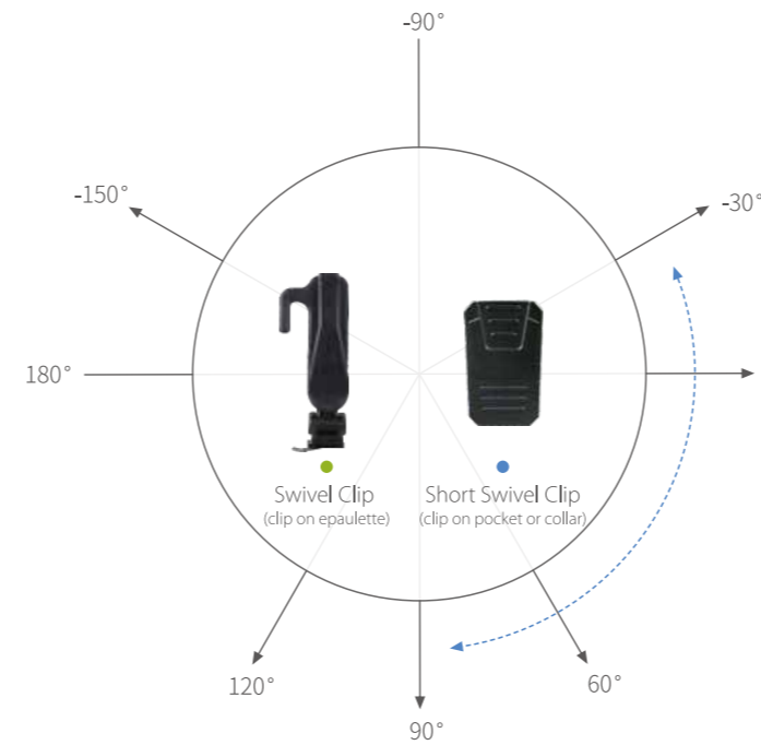
Adjust recording angle by rotating 30° every time, 360° maximum.