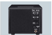
SP-23 EXTERNAL SPEAKER 4 audio filters; headphone jack. Input impedance: 8Ω Max. input power: 5W (Not available for EU countries)