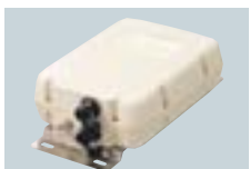
AH-4 AUTOMATIC ANTENNA TUNER Covers 3.5–30 MHz with a 7 m (23 ft) or longer wire antenna.