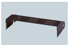
IC-MB5 MOBILE BRACKET For installing the transceiver under a table, in a vehicle, etc.

FL-52A CW/RTTY narrow; 500 Hz/–6 dB FL-53A CW narrow; 250 Hz/–6 dB FL-222 SSB narrow; 1.8 kHz/–6 dB FL-257 SSB wide; 3.3 kHz/–6 dB