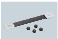
MB-23 CARRYING HANDLE For easy portability.