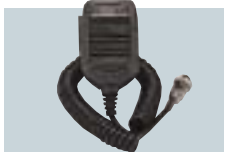
HM-36 HAND MICROPHONE Same as that supplied.