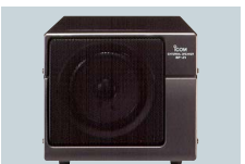
SP-21 EXTERNAL SPEAKER Input impedance: 8Ω Max. input power: 5W SP-20 EXTERNAL SPEAKER is also available.