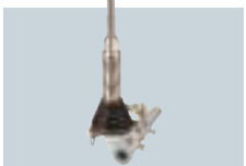
AH-2b ANTENNA ELEMENT For mobile operation with the AH-4. All bands between 7–30 MHz can be matched.