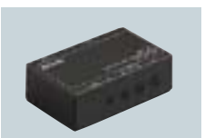
CT-17 CI-V LEVEL CONVERTER For remote transceiver control from a PC equipped with an RS-232C port.