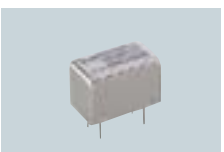
CR-338 HIGH STABILITY CRYSTAL UNIT Contains a temp. compensating heater for improved frequency stability. Frequency stability: ±0.5 ppm