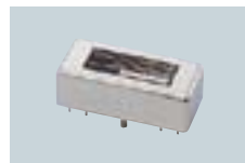
455 kHz FILTERS Have good shape factor and provide you with better reception.

FL-52A CW/RTTY narrow; 500 Hz/–6 dB FL-53A CW narrow; 250 Hz/–6 dB FL-222 SSB narrow; 1.8 kHz/–6 dB FL-257 SSB wide; 3.3 kHz/–6 dB