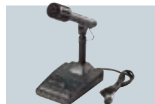
SM-20 DESKTOP MICROPHONE High quality desktop microphone. Includes [UP]/[DOWN] switches and low cut function.