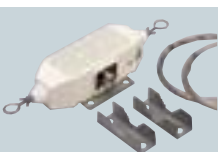
MN-100 ANTENNA MATCHER Match the transceiver to a dipole antenna without applying DC power. 8 m×2 antenna wires come attached.