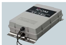
AT-140 HF AUTOMATIC ANTENNA TUNER Covers 1.6–30 MHz with a 7 m (23 ft) or longer wire antenna. AT-130/E is also available.